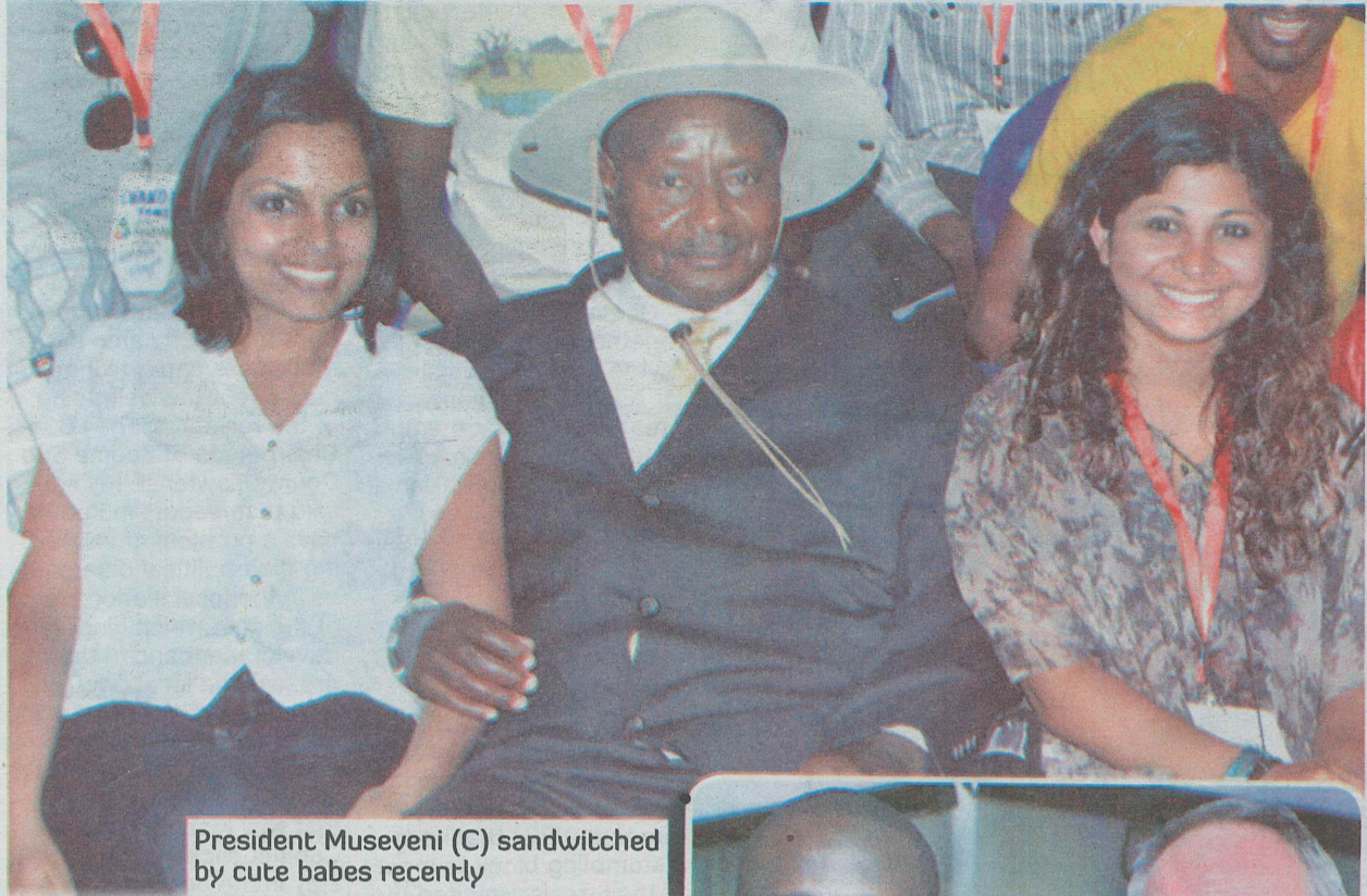
President Museveni (C) sandwiched by cute babes recently