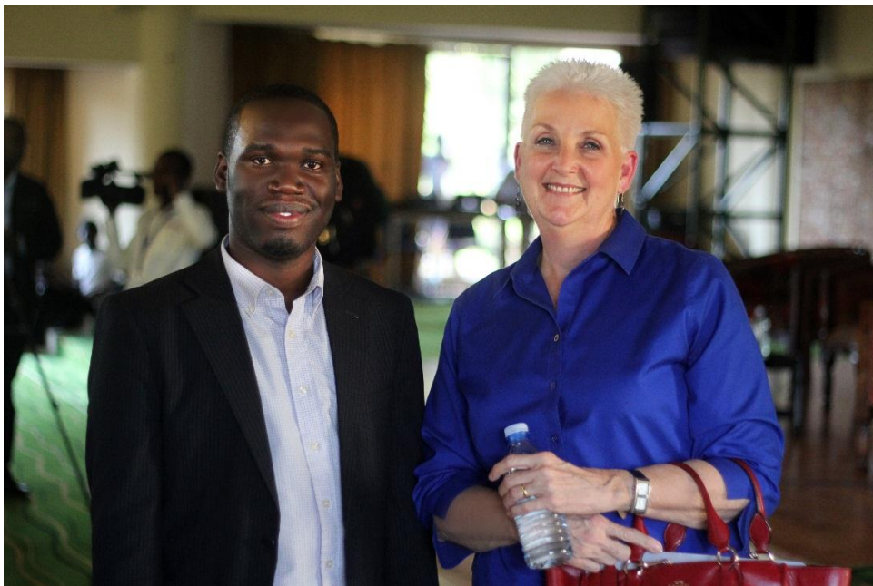
U.S Ambassador Deborah R Malac seeming to have light moment with their ally Kivumbi Earnest Benjamin recently in Kampala, Uganda.

History has always stressed luck as the number one thing and equally so the Baganda say that Akaliba akendo o'kalabila ku mukonda literally meaning that what will be great is reflected by its appearance. All powerful people in the world have met incredible people at the time there rising in key positions and only God can always make a way for them even at a point of impossibility.